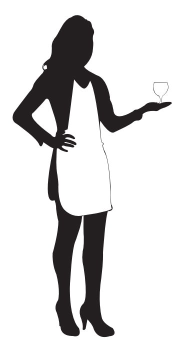
Age 18 & Up

16-17 year-old teens have fewer restrictions than their younger counterparts.